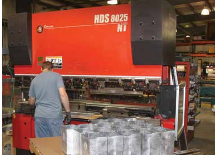
Above: A VIPROS laser at IMEC. Above Right: A press brake at IMEC. Below: Parts produced at IMEC.